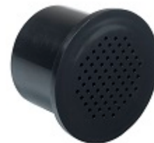
Active charcoal filter - FILTRE1 It's recommended to change it every years.

**Thanks to the Vinotag® application, benefit from a digital register of your wine cellar and be alerted of the peak dates of your wines. In partnership with Vivino, scan your bottle to access its pre-filled wine sheet.